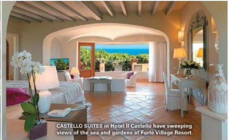
CASTELLO SUITES in Hotel Il Castello have sweeping views of the sea and gardens at Forte Village Resort.

since the resort has so many other activities that the beach isn't the activity for the day; it's an activity in any day.