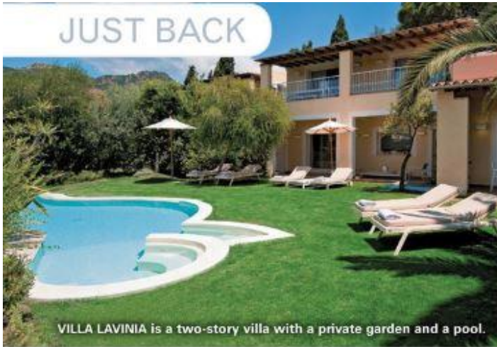
VILLA LAVINIA is a two-story villa with a private garden and a pool.